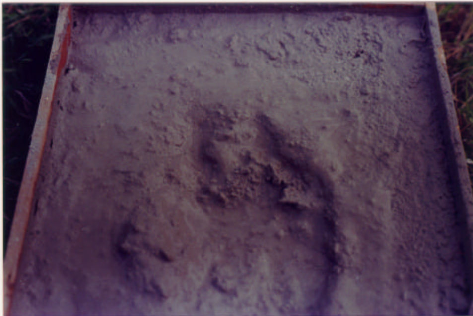
The first and second toes are quit well defined.