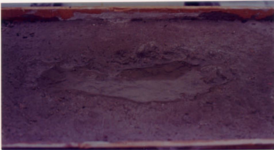
Lower portions of the track fill with loose material.